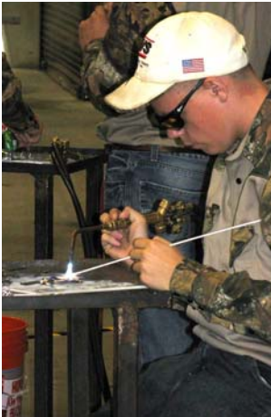
2011 Career & College Fest