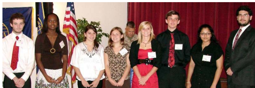
The 2010 AFCEA scholarship recipients recognized at a luncheon at MacDill AFB.

Each year we host a scholarship reception at MacDill AFB and it's always so rewarding for the AFCEA members to meet these high achieving students and their families. For the majority of these students receiving a $1,500 to $5,000 is just what is needed to ensure they are equipped to handle the first year expenses of attending a university.