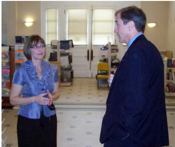
U.S. Representative Kathy Castor recently visited the Foundation to learn more about its programs and walk through our historic building.

First grade students of E. L. Bing Elementary participated in hands-on interaction with tools to enhance scientific learning and interest in the sciences as a result of a grant from the Foundation. From magnetic wands to big screen microscopes, students engaged in a handful of activities that the "Exploration Station"